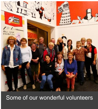
Some of our wonderful volunteers

During Covid our amazing volunteers have continued to keep our doors open and welcome visitors to the Gallery. Their enthusiasm and dedication have made such a difference to the gallery. They have had to step up and meet all the challenges that Covid and lockdown forced upon us and they always show our visitors what we have to offer with a smile on their face.